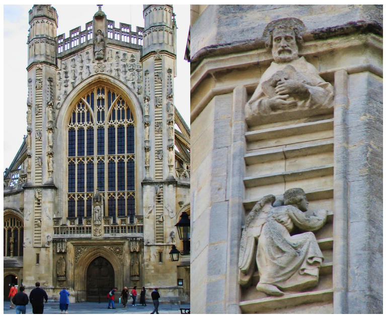
Figure 3. Stephen T. Whitlock, 1951–: Jacob's Ladder , Bath Abbey, 9 October 2004.<sup>120</sup>

and winter shall not fail; but when it shall disappear, woe to that generation, for behold the end cometh quickly.<sup>134</sup>