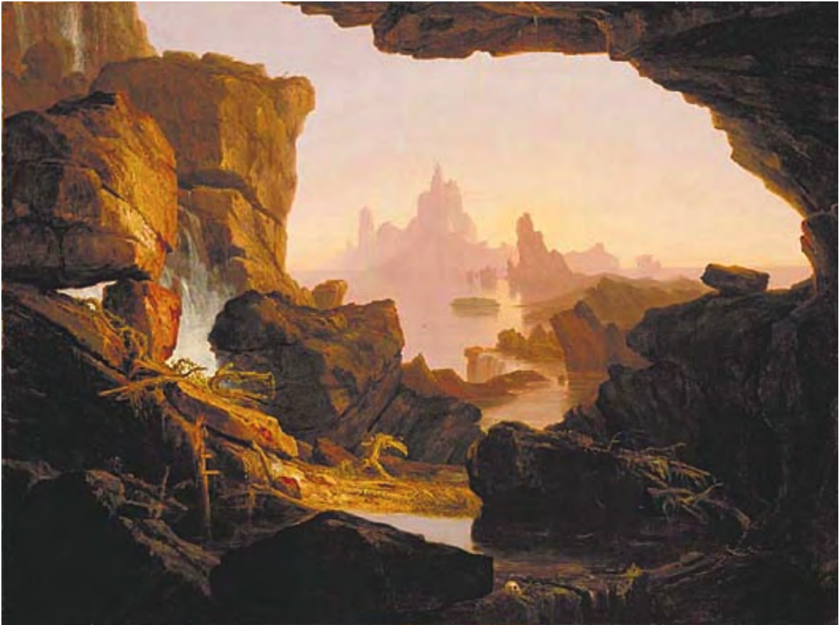
Figure 1. Thomas Cole, 1801-1848: The Subsiding Waters of the Deluge, 1829

An Old Testament KnoWhy 1 for Gospel Doctrine Lesson 6: "Noah ... Prepared an Ark to the Saving of His House" (Moses 8:19-30; Genesis 6-9; 11:1-9) (JBOTL06A). See the link to the video supplement to this lesson at the end of this article under "Further Reading."