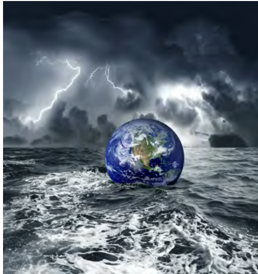
Figure 6. The Ark as a Mini-Replica of Creation 47

Despite its ungainly shape as a buoyant temple, the Ark is portrayed as floating confidently above the chaos of the great deep. Significantly, the motion of the Ark “upon the face of the waters” 44 paralleled the movement of the Spirit of God “upon the face of the waters” 45 at the original creation of heaven and earth. The deliberate nature of this parallel is made clear when we consider that these are the only two verses in the Bible that contain the phrase “the face of the waters.” In short, we are made to understand that in the presence of the Ark there has been a return of the same Spirit of God that had hovered over the waters at Creation — the Spirit whose previous withdrawal had been predicted in Genesis 6:3. 46