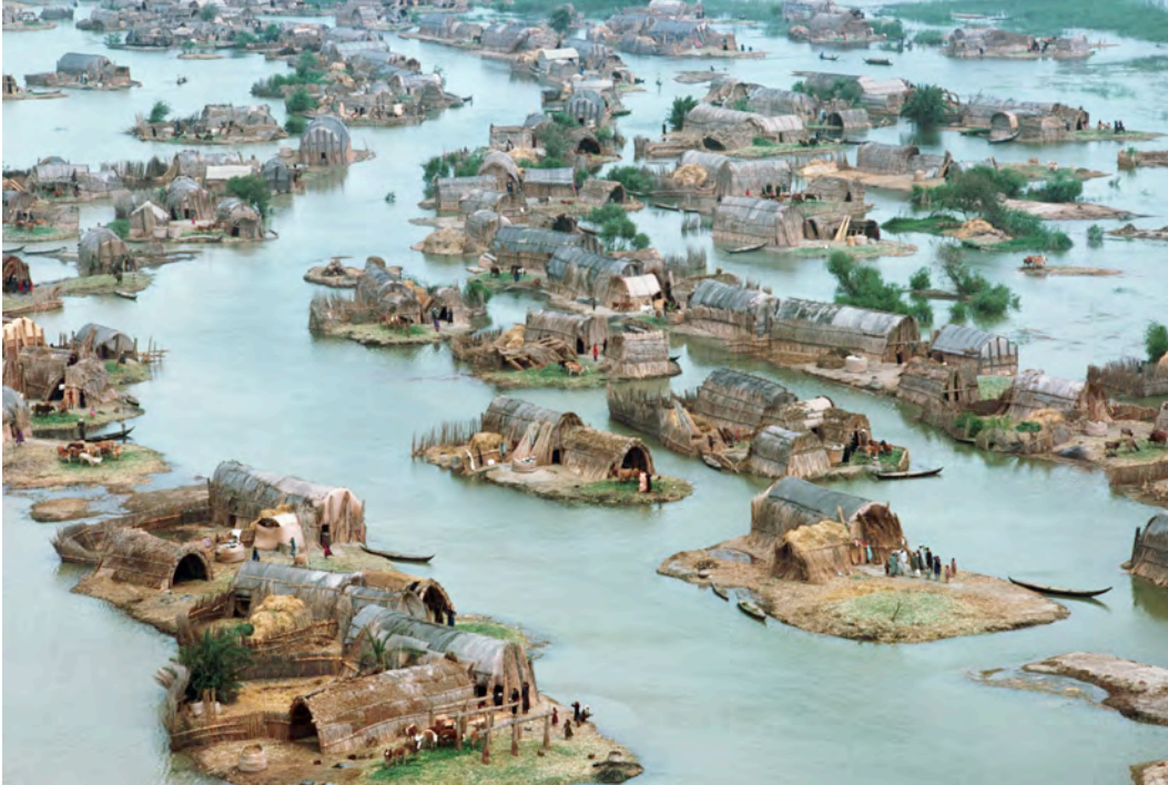
Figure 5. Nik Wheeler, 1939-: Marsh Arab Village, 1974