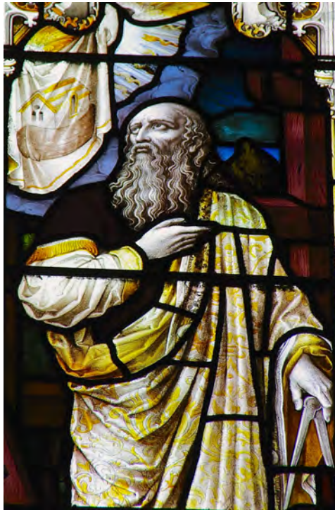
Figure 3. Noah Sees the Ark in Vision. Detail of Patriarchs Window, Holy Trinity Church, Stratford-upon-Avon, England

Resemblances between the Ark and the Tabernacle. It is significant that, apart from the Tabernacle of Moses 10 and the Temple of Solomon, 11 Noah's ark is the only man-made structure mentioned in the Bible whose design was directly revealed by God. 12 In this image, God shows the plans for the Ark to Noah just as He later revealed the plans for the Tabernacle to Moses. The hands of Deity hold the heavenly curtain as Noah, compass in his left hand, regards intently.