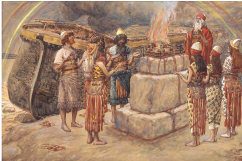
Figure 7. J. James Tissot, 1836-1902 : Noah’s Sacrifice , ca. 1896-1902

Note also that it was “in the six hundred and first year [of Noah’s life] in the first month, the first day of the month” that “the waters were dried up.” 61 The wording of this verse would have hinted to ancient reader that there was special significance to the date. They would have remembered that it was also the “first day of the first month” 62 when the Tabernacle was dedicated, and that “Solomon’s temple was dedicated at the New Year festival in the autumn.” 63