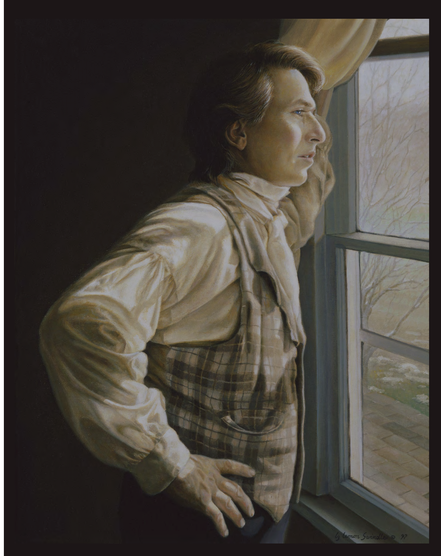
FIGURE P-1. Go with Me to Cumorah, 1997. Liz Lemon Swindle, 1953-