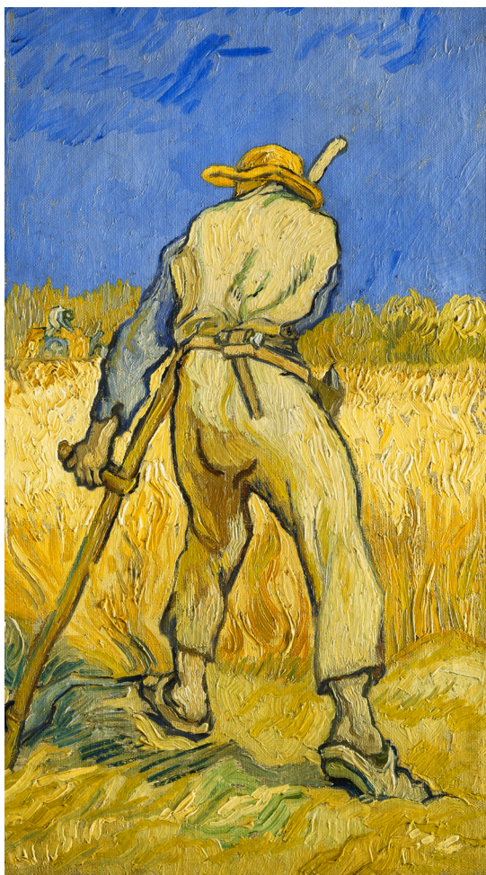
Figure 7. Vincent van Gogh, 1853–1890: Le Moissonneur

open their mouths,” the Lord declares that He is “not well pleased” and proclaims “wo unto such,” for His “anger is kindled against them.” 135