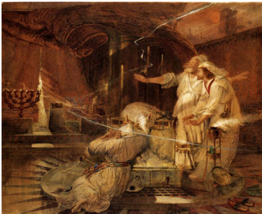
Figure 8. William Bell Scott, 1811–1890: The Renting of the Veil , 1867–1868

joints and marrow, and is a discerner of the thoughts and intents of the heart. Neither is there any creature that is not manifest in his sight: but all things are naked and opened unto the eyes of him with whom we have to do. 139 The sharp blade of this sword enables God’s laborers to discern between the righteous and the wicked. 140