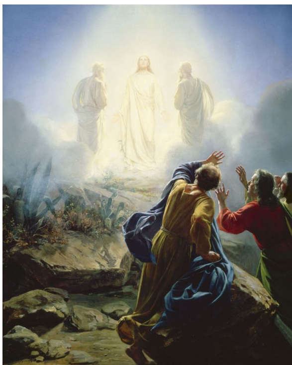
Figure 15. Carl Heinrich Bloch, 1834–1890: The Transfiguration

priesthood.” 346 Thus, to Latter-day Saints, it is not surprising to see this passage end with Peter’s plea for disciples to “make [their] calling and election [= Greek ekloge ] sure [= Greek bebaios , ‘reliable, unshifting, firm’]” 347 through the practice of these virtues, “For in this way entry into the eternal kingdom of our Lord and Savior Jesus Christ will be richly added to you.” 348 Though it is true that no explicit mention is made in the Bible of the performance of rites inculcating this divine pathway of virtues, it is equally true that a lecture based on 2 Peter 1:3–11 would not in the least be out of place as a summary of progression through LDS temple ordinances.