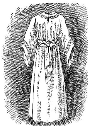
Figure 6. The Wedding Garment

ye are called to the work. Though individuals are initially called to the work because of their righteous desires , it remains to them whether they will actually perform the work with their might. Not all who are called will be chosen or “elected.” 114