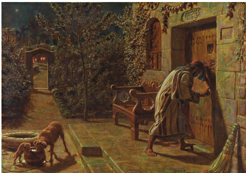
Figure 18. William Holman Hunt, 1827–1910: The Importunate Neighbour , 1895

and Merciful, will hear and answer ... The Lord’s purpose in giving the parable is specifically stated; it was “to this end, that men ought always to pray, and not to faint” [= Greek ekkakeo , to be weary or to lose heart].