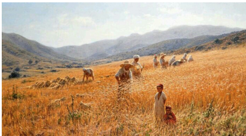
Figure 5. Antoine Gadan, 1854–1934: Les Moissonneurs , 1910

Whoever’s walk is blameless, whoever’s deeds are righteous.