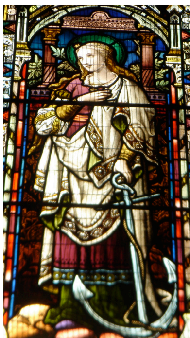
Figure 10. Charity with an Anchor , 1876

Note the distinction between the “words of eternal life” — meaning the sure promise of exaltation that can only be received in an anticipatory way “in this world” — and “eternal life” itself, which will be given “in the world to come.”