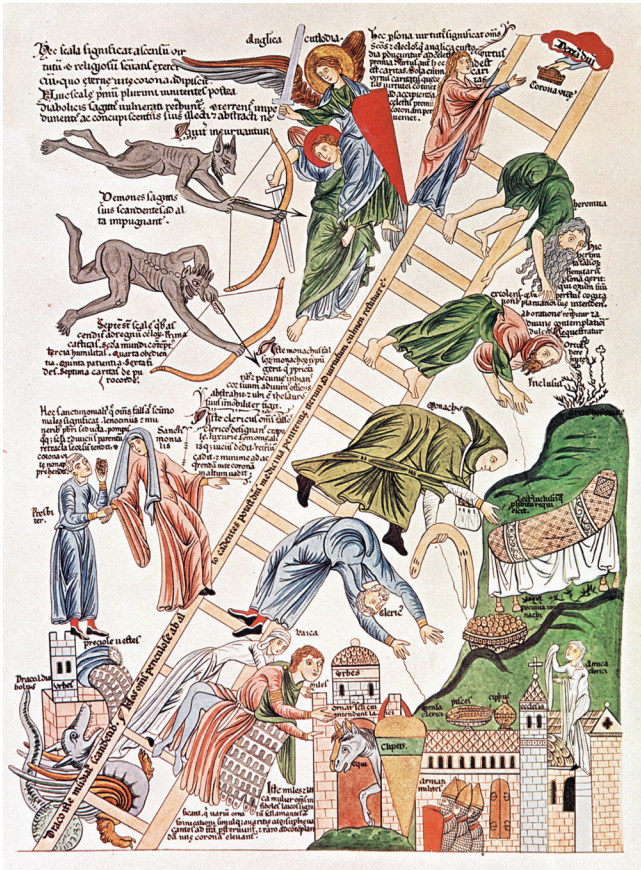
Figure 14. Herrad of Hohenbourg; The Ladder of Virtues , late twelfth century. The figure of Charity, representing those who have had their election “made sure,” is depicted as having reached the summit of the ladder. Her hand is extended toward the hand of the Lord, shown emerging from a cloud and holding the crown of Life. Other personages below her fall short as they are attracted by one thing or another. The hermit is too busy cultivating his garden and neglects his prayers; the reclusive monk longs for sleep; the alms-seeking monk falls for a large basket filled with pieces of silver — what his heart treasures most; the priest’s attention is not occupied by his church but rather by friends, good food and drink, lusts of the flesh, and simony (i.e., the selling of ecclesiastical privileges for money); the nun chatting with the priest is seduced by the pleasures of the world and by family wealth; while the lay woman (attracted to jewels and beautiful lodgings) and the soldier (tempted by horses, arms, and other soldiers to command) have hardly begun the climb. At the bottom of the ladder, the Devil, whose temptations have ensnared all except Charity herself, appears in the form of a dragon, while his minions take steady aim at their victims with bow and arrow. The caption on the ladder bears a message of encouragement, proclaiming that all those who have fallen will have the opportunity, through sincere penitence, to begin their climb anew.