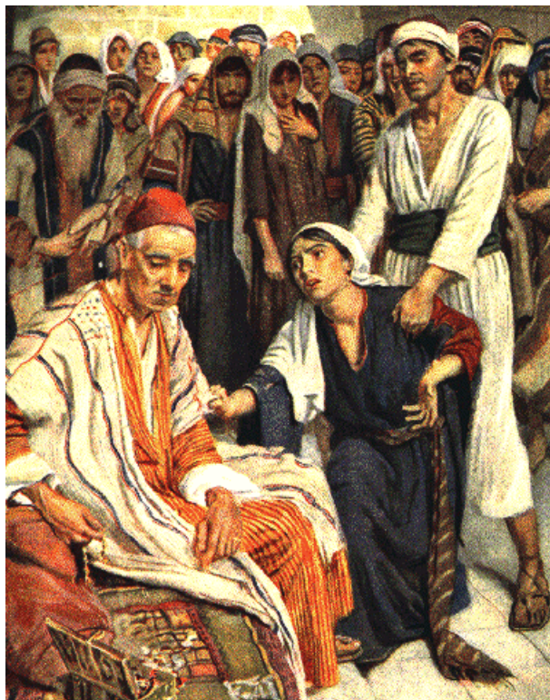
Figure 17. Harold Copping, 1863–1932: Parable of the Judge and the Widow

stranger to Him, and that if, on the day of final judgment 379 such persons are found to have “[wasted] the days of [their] probation,” 380 they must be “cast out” from the Lord’s presence. Clearly, as John Bunyan expressed it, “there [is] a way to hell, even from the gate of heaven.” 381