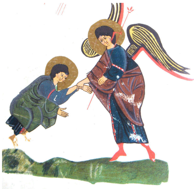
Figure 4. Yahoel Lifts the Fallen Abraham , Codex Sylvester, 14 th century

before heavenly messengers can perform their errands to Ezekiel, 88 Daniel, 89 and Paul, 90 they must first command these men to stand on their feet. 91 As biblical scholar Robert Hayward has said: “You stand in the temple, 92 you stand before the Lord, 93 you pray standing up 94 — you can’t approach God on all fours like an animal. If you can stand, you can serve God in His temple.” 95 If you are stained with sin, you cannot, with integrity, stand in His presence. 96