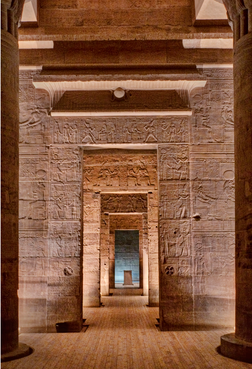
Figure 13. Stephen T. Whitlock, 1951:- Temple of Isis, Philae, Egypt , 2015. Passage through an ascending sequence of spaces of increasing holiness by means of a series of narrow doors or gateways is a near-universal feature of ancient temples.