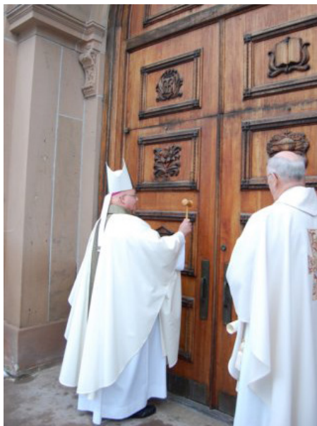
Figure 16. A New Bishop Knocks Three Times with a Mallet on the Door of the Cathedral as Part of a Roman Catholic Entrance Ritual 364

Ask , and it shall be given you; seek , and ye shall find; knock , and it [meaning the final barrier that separates us from the Father] shall be opened unto you: