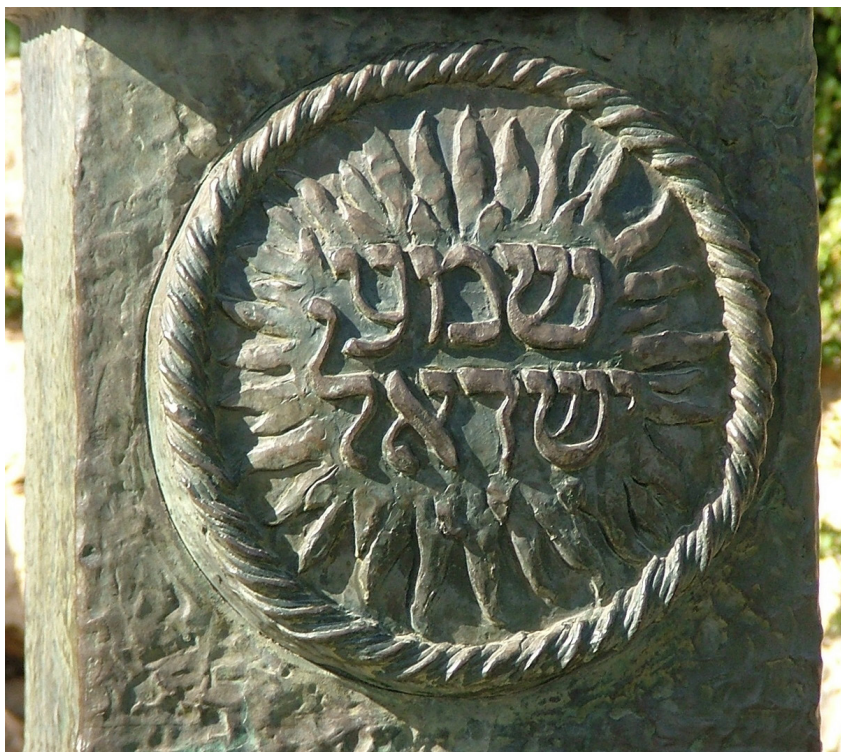
Figure 3. “Shema Yisrael” at the Knesset Menorah in Jerusalem

Although Section 4 tells us that we are to serve God 62 with all our “heart, might, mind, and strength,” Deuteronomy 6:5 tells us to “ love the Lord thy God with all thine heart, and with all thy soul, and with all thy might.” 63 Love and service were equated by Jesus when He said: “If ye love me, keep my commandments.” 64 Let us now digress to examine in more detail the Hebrew of Deuteronomy 6:5.