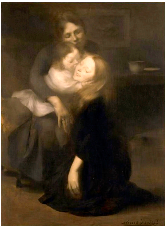
Figure 9. Eugène Carrière, 1849–1906: Intimacy, or The Big Sister , ca. 1889

elsewhere in scripture, 161 these terms are used to describe “stages in a Christian’s earthly experience.” 162