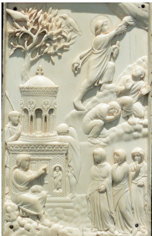
Figure 11. The Woman at the Tomb and the Ascension, ca. 400

Although we have entered the gate of repentance and baptism 227 by exercising “unshaken faith,” “relying wholly upon the merits” 228 of Christ, it is intended that we grow spiritually through a combination of our efforts and His strengthening power in gradual fashion until, someday, we come to “be like him.” 229 Moroni 7:41 explains that the ultimate goal of receiving an inheritance in the presence of God is the central theme of these additional covenants and ordinances found in the temple: “And what is it that ye shall hope for?