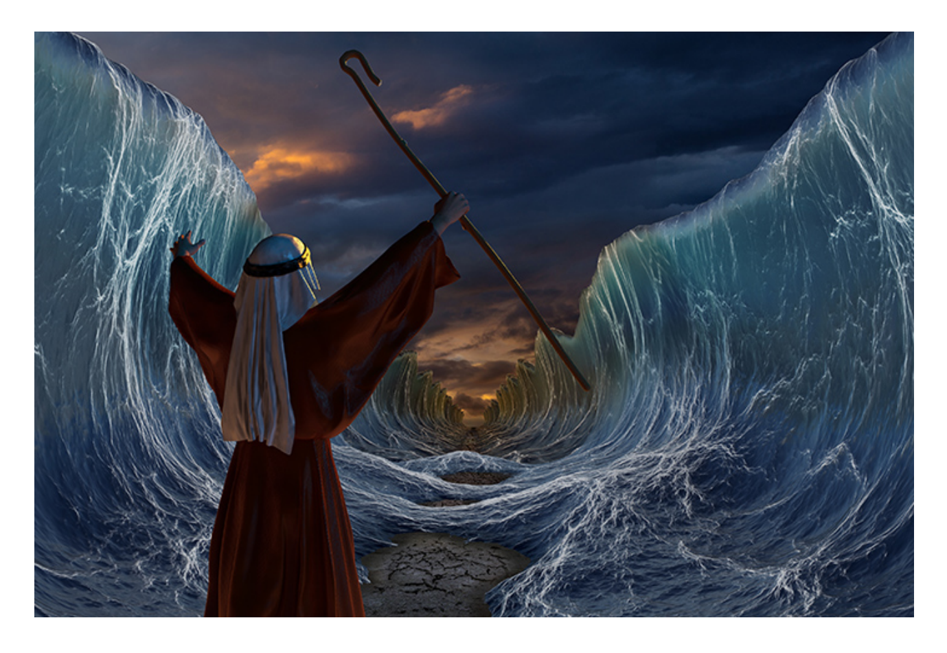
When We are Up against a Red Sea—Come Follow Me Old Testament Podcast #15, Exodus 14-17

By Scot and Maurine Proctor · March 31, 2022