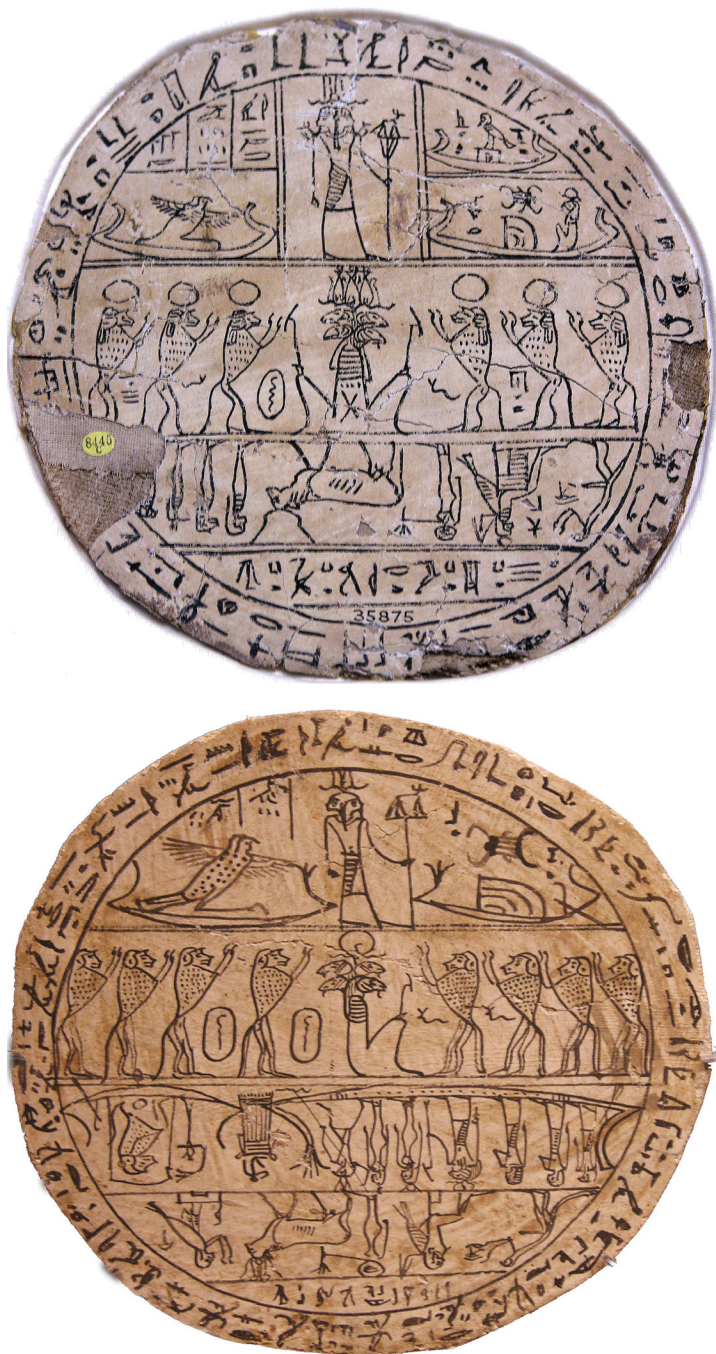
Figure 6. Two Egyptian hypocephali, representing circular depictions of the cosmos. Top: British Museum 35875 (formerly 8445c); bottom: Louvre Museum E 6208. 138