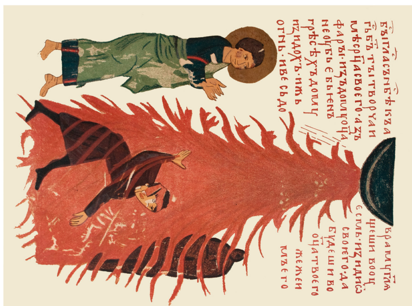
Figure 4. The House of Terah Destroyed by Fire.