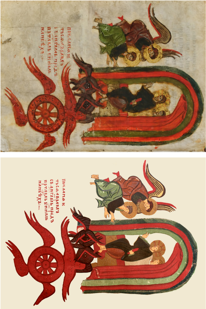
Figure 13. Abraham and Yaho'el Before the Divine Throne.