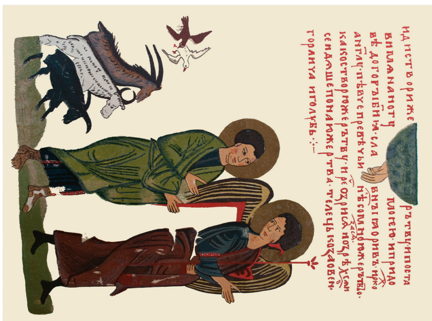
Figure 3. Abraham with Sacrificial Animals. Left: Photo of the Codex Sylvester. Right: Photo of the facsimile version.