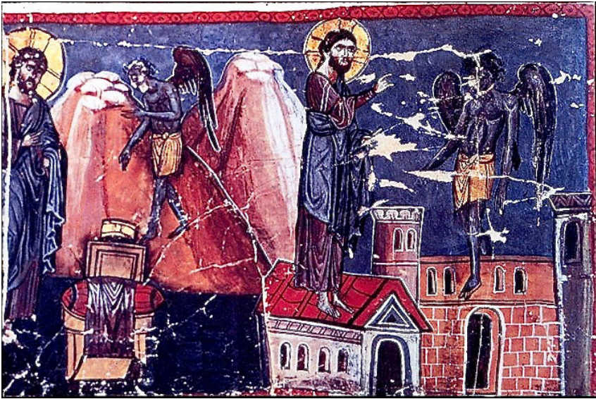
Figure 9. The Temptation of Christ, King Gagit I of Kars Gospels, ca. 1050. 164