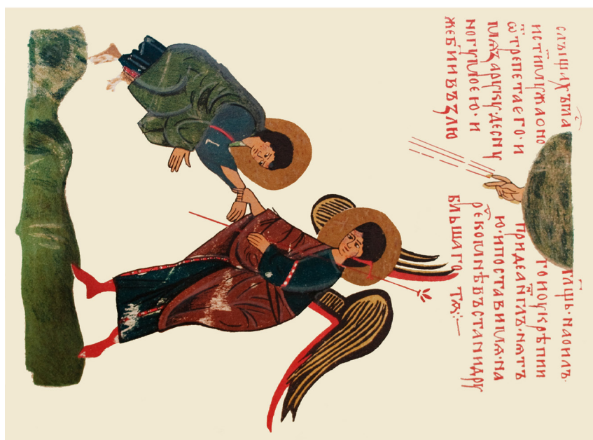
Figure 7. Abraham Falls to the Earth and Is Raised by Yaho'el.