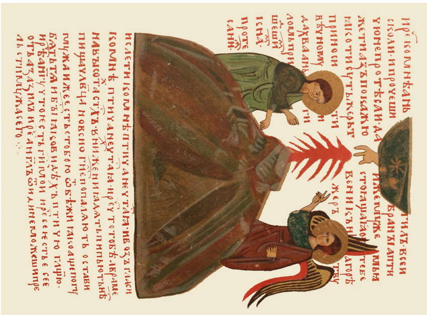
Figure 5. Abraham's Sacrifice Is Accepted of the Lord.