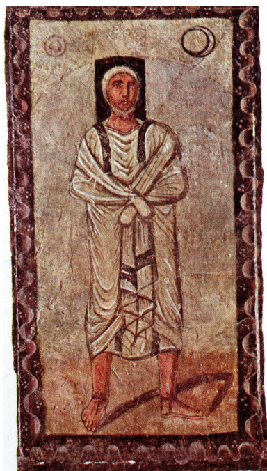
Figure 12. Moses with the sun, moon, and seven stars (i.e., planets) above his head from the Jewish synagogue at Dura Europos. 239 It represents Moses's recitation of a "hymn" near the end of his ascent. 240

ascent. 236 Near the end of Abraham's recitation, he implores God to accept the words of his prayer and the sacrifice that he has offered, to teach him and to "make known to your servant as you have promised me." 237 Then, "while [he] was still reciting the [hymn]," the veil opens and the throne of glory appears to his view. 238