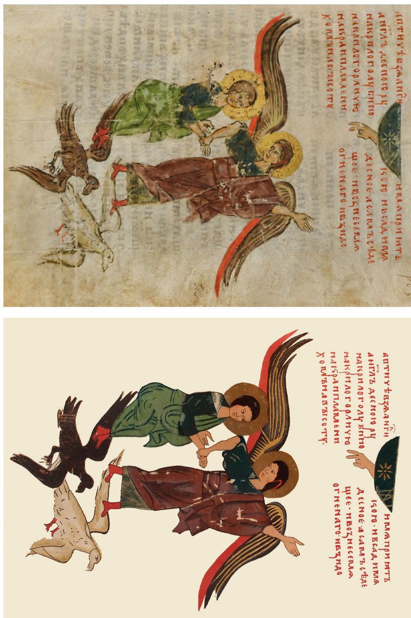
Figure 10. Ascent of Abraham and Yaho'el.