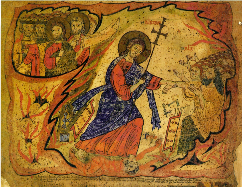
Figure 8. The Harrowing of Hell. The Barberini Exultet Roll, ca. 1087. 153

Medieval Christian depictions such as this one shown in Figure 8 that show of the resurrected Christ raising up the dead by the same gesture 152 further guide our intuitions about the importance of the raising of Moses and Abraham and how it may have been meant to be understood by the illustrator of the Codex Sylvester.