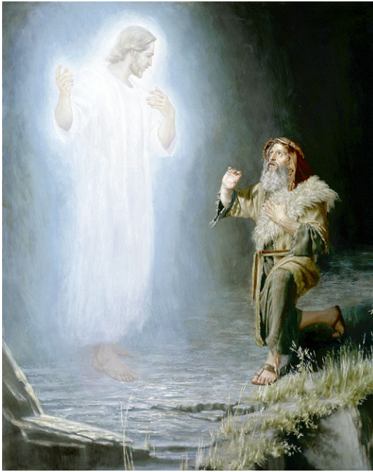
Figure 1. Joseph Brickey: Moses Seeing Jehovah . 43