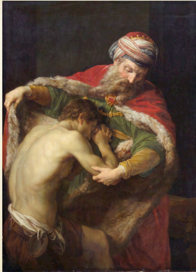
Pompeo Batoni, 1708-1787: The Return of the Prodigal Son , 1773

The great [Arab writer] Abu Zaid said there was one prayer that he had learned in a dream which alone was his guarantee of safety in the desert: “Preserve me, O God; ... guard me in my person and my property.... Cover me with the curtain of grace.” Just as Nephi prays: “O Lord wilt thou me encircle me around in the robe of thy righteousness!” 33