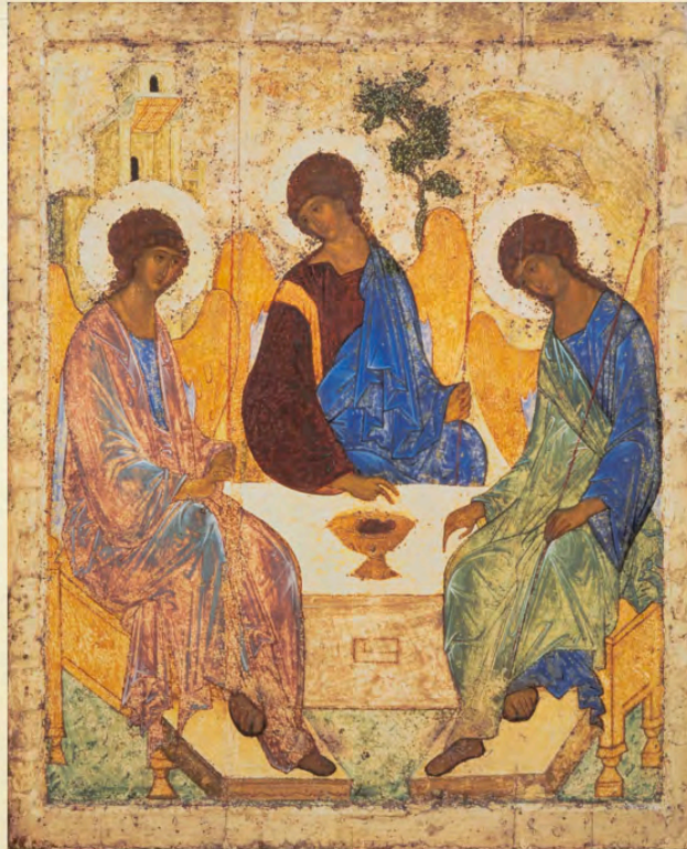
Andrei Rublev, ca. 1360-70-ca. 1427-30: The Holy Trinity , ca. 1408-1425

A parallel account involving three divine messengers can be found in the story of Abraham. 30 In the Orthodox Church, the famous icon by representing this event is used as a symbol of the oneness of the Godhead, and the “beginning of the promise of Redemption” which reached “its fulfillment on the day of the Pentecost,” binding together the Old Testament and New Testament Churches. 31