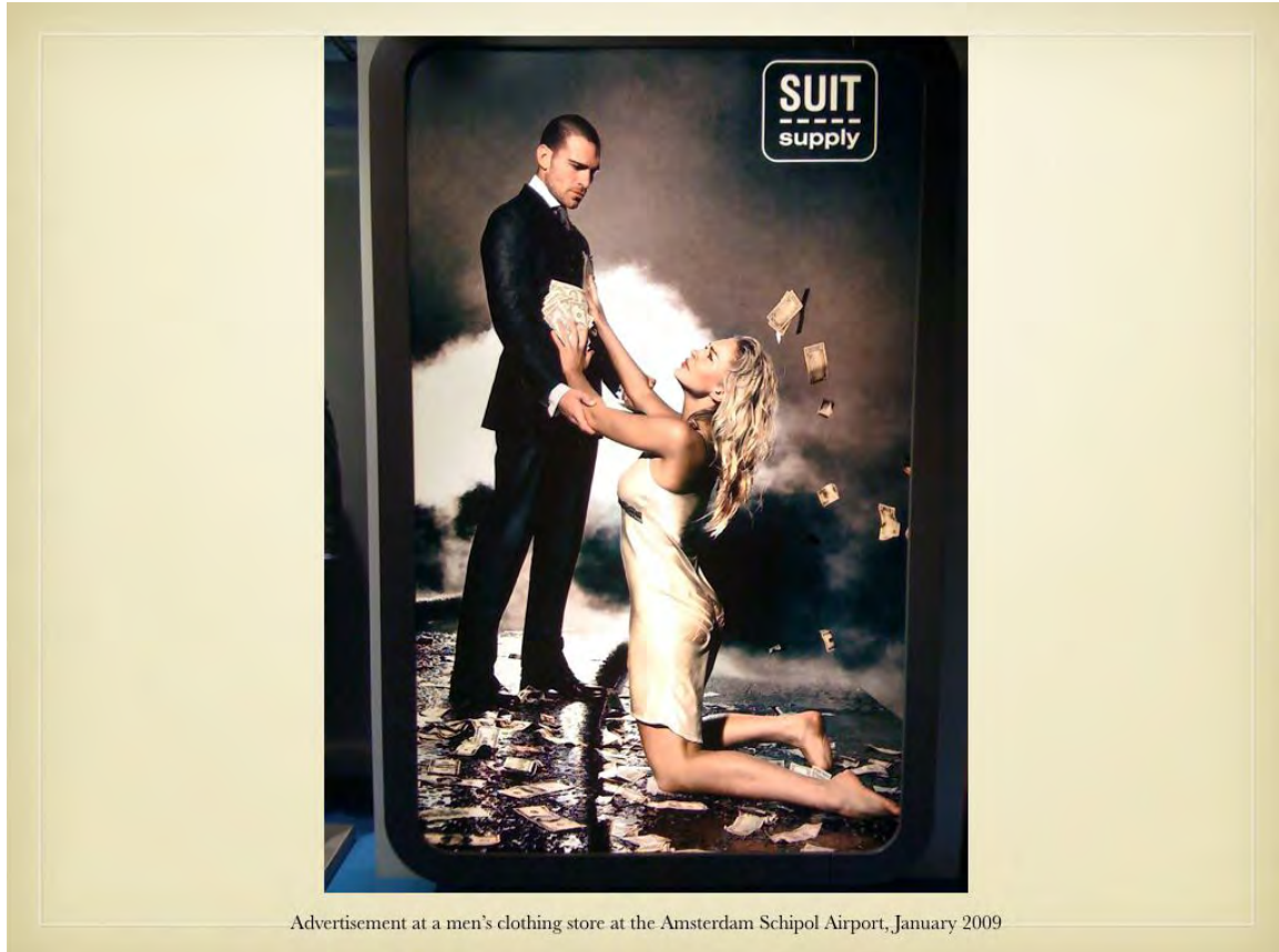
Advertisement at a men's clothing store at the Amsterdam Schipol Airport, January 2009

materialism, a premonition of the opportunities and dangers awaiting the United States as it recovered from the Great Depression.” 4 Old Scratch is portrayed as polite, refined, and soft-spoken—and as usual, he “gets the best lines” as he preaches his gospel of cold cash to a down-on-his-luck New Hampshire farmer. Warned Benét: “[I]f a smooth-spoken and businesslike stranger should appear at your door and offer you all that money can buy in exchange for your freedom of soul, it might be well to look him over rather carefully. I seem to have heard that there are such people abroad in the world, even today.” 5