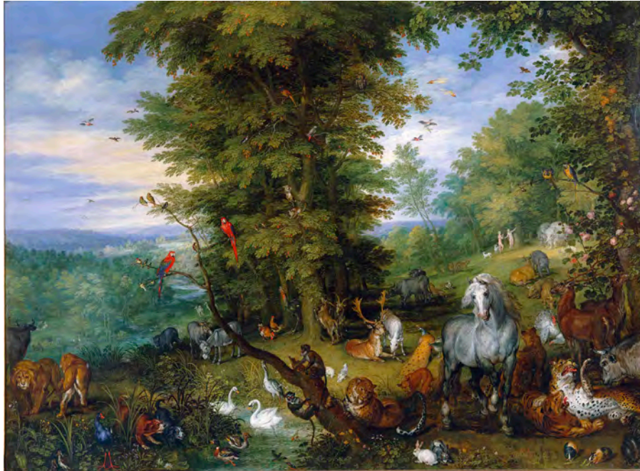
Figure 1. Jan Brueghel, the Elder, ca. 1568-1625: The Garden of Eden, 1612. Brueghel masterfully fills the foreground of the scene with the abundance, happiness, and beauty of newly created life, and then skillfully draws our eyes toward the two tiny figures in the background ominously reaching for the fruit of the Tree of Knowledge.

An Old Testament KnoWhy1 for Gospel Doctrine Lesson 4: “Because of My Transgression My Eyes Are Opened” (Moses 4; 5:1–15; 6:48-62) (JBOTLo4A). See the link to the video supplement to this lesson at the end of the article under “Further Reading.”