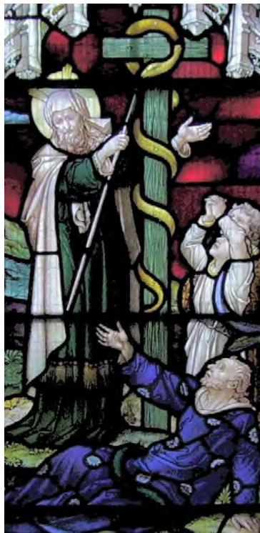
Figure 3. Moses and the Brazen Serpent (detail), ca. 1866

...he made the two trees seem identical: the Tree of the Knowledge of Good and Evil would open her eyes, and she would be like God, knowing both good and evil. Almost the same was true of the Tree of Life, for Wisdom opened the eyes of those who ate her fruit, and as they became wise, they became divine. 32