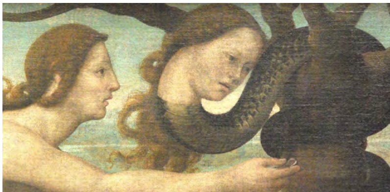
Figure 2. Giuliano Bugiardini, 1475-1554: Adam, Eve (detail), ca. 1510. Portraying a serpent whose face resembled Eve’s was not meant to imply that the woman was devilish, but rather as a way of showing that the Devil tried to allay Eve’s initial fears. Bugiardini, like some others of his time, pictured Satan as deceptively attempting to win her trust by appearing with hair and facial features that resembled her own exactly.

The explicit declaration of scripture is that “Satan ... sought to beguile Eve.” 27 Ancient and modern Hebrew scholars agree that the primary meaning of “beguile” is to “deceive.” The actions of Adam and Eve in making the fig leaf aprons and hiding from God witness their doubtful state of mind following the transgression. Why not accept Eve’s own straightforward explanation of what happened? In the admirable candor and simplicity of her confession, she both admitted the deception and rightfully laid blame on Satan — the only one who actually deserved it: “The serpent beguiled me, and I did eat.”